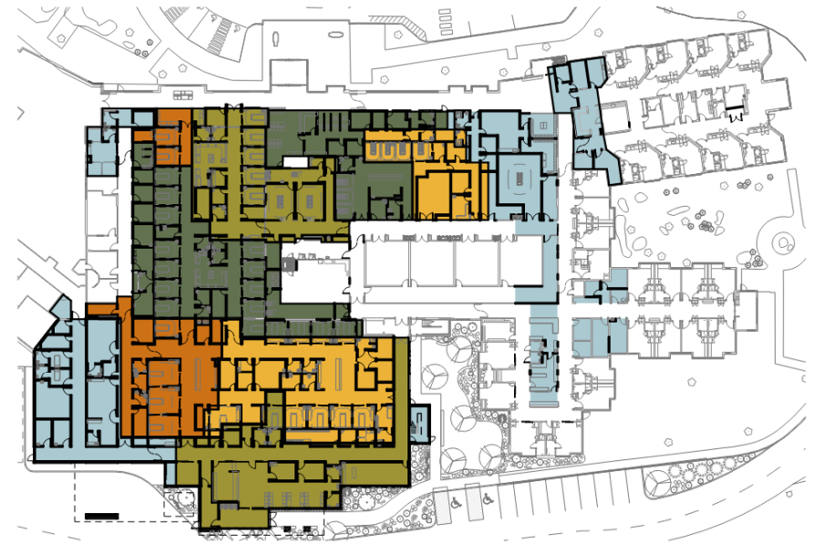
2 SD - LEVEL 1 PHASING PLAN - NEW SCALE: 1" = 60'-0"