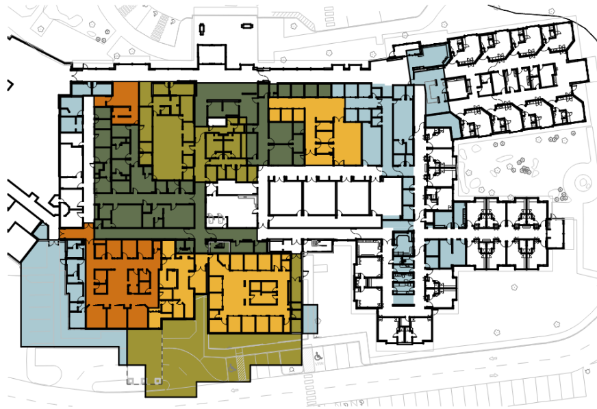
1 SD - LEVEL 1 PHASING PLAN - EXISTING SCALE: 1" = 60'-0"