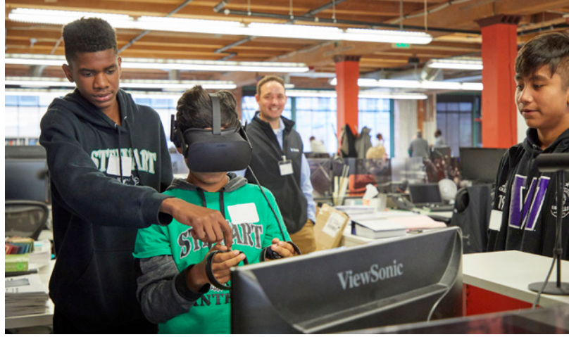
Students learn about the architectural industry at this BCRA-hosted STEM day