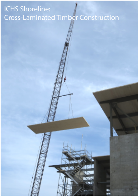
ICHS Shoreline: Cross-Laminated Timber Construction

Miller Hayashi partners with the Owner and construction team to anticipate potential challenges to the project schedule.