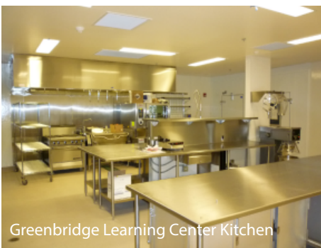
Greenbridge Learning Center Kitchen

Miller Hayashi partners with the Owner and construction team to anticipate potential challenges to the project schedule.